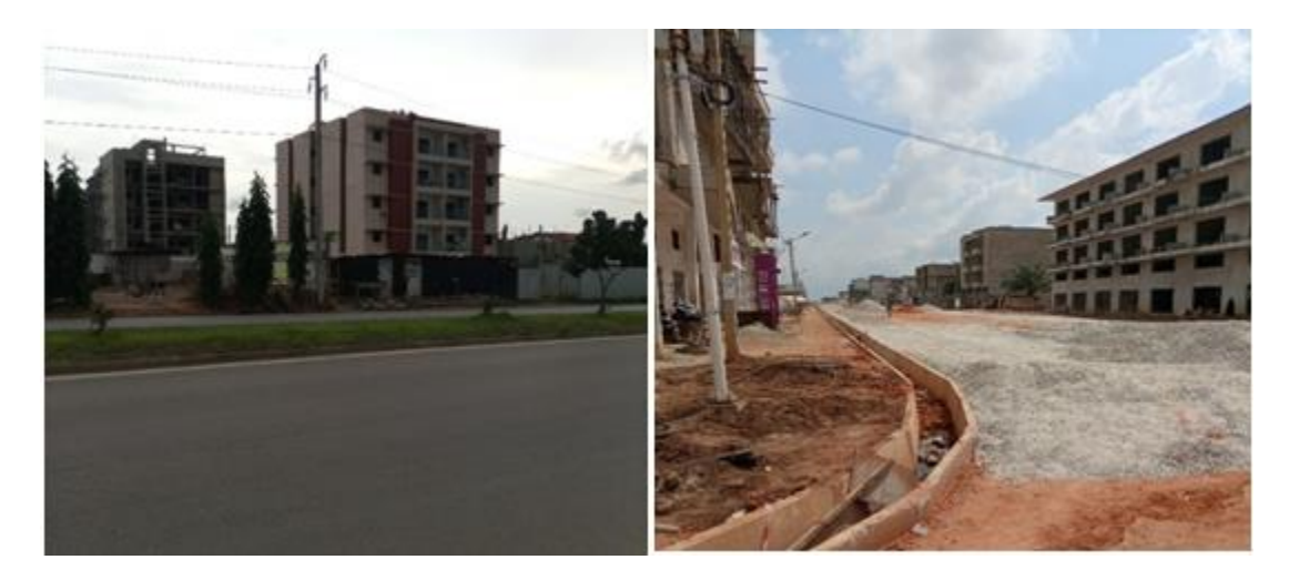
Figure 2. View of the buildings being finished near the UHC(Kobenan, 2020)

Its establishment in the district has not only triggered several large-scale real estate operations, but also led to an increase in the land value in the area. Indeed, initially sold, during the period of 2000 and 2010, between $ 4312.40 and $ 8624.81 for 600 m<sup>2</sup> and 700 m<sup>2</sup> lands, the financial value of these same surface of lands now ranges between $ 43124.03 and $ 103497.66, depending on their geographical location in relation to the University Hospital and certain infrastructures. This represents an increase of approximately 90% of the cost of sale of the sameland surface which is practiced in the district. Also, the opening of the University Hospital since 2017 has led to a real estate boom in the neighborhood. As a result of the presence of the University Hospital, chic cities composed of large villas hidden behind large fences and buildings of R+3 and R+4 have been built in its perimeters (Figure 2).