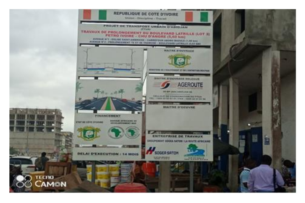
Figure 3. View of a plaque announcing the construction of service roads for the UHC (Kobenan, 2021)

These arethe routes of the 7<sup>e</sup>, 8<sup>e</sup> and 9<sup>e</sup> sectors and of Saint-Viateur, thus making it possible to connect the Angré and Riviera Palmerais neighborhoods. With a length of 7.687 kilometers, the access roads to the UHC are composed of two main routes: -the route going from the southwest sector precisely of the 7<sup>e</sup>, 8<sup>e</sup> tranches through the Rosiers 6<sup>e</sup>program to the UHC. This route is a 2x2 lanes with a mixed structure bridge, metal and concrete, 110 meters long. The construction of the bridge aims to cross the natural obstacle that is the V-shaped valley separating the 7<sup>e</sup>, 8<sup>e</sup>tranches and Rosiers sectors, from the 7<sup>e</sup>, 9<sup>e</sup>sectors;-the route from Collège Saint-Viateur to the Riviera palmeraisand to the UHC is a 2x1 lane road.