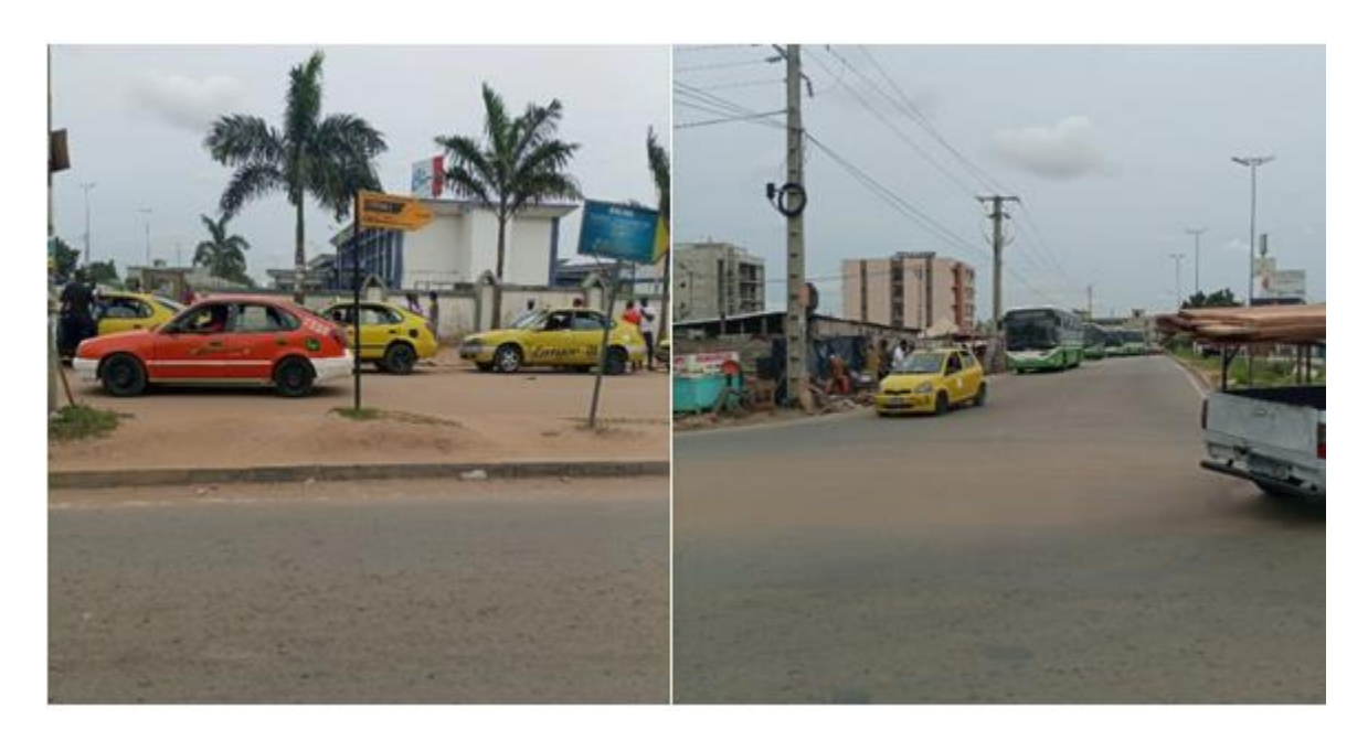
Figure 6.View of Wôrô-wôrôand bus of SOTRA coming from the UHC of Angré (Kobenan, 2021)

The local populations, who used to face real difficulties in getting around, now benefit from a fluidity in mobility with the implementation of these public transport lines. Also, the transport lines in turn promote commercial activities in and around the stations.