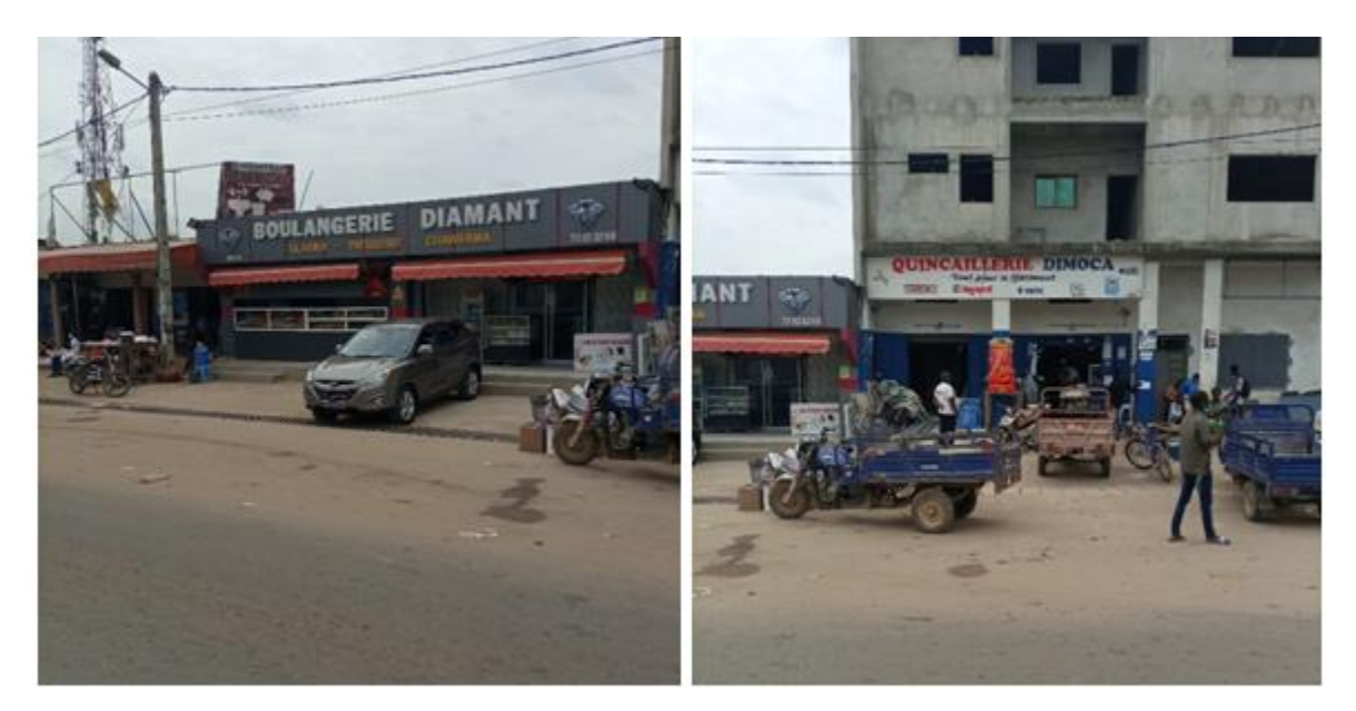
Figure 4. View of commercial activities near the UHC access roads(Kobenan, 2021)

4).The development of economic activities along the access roads to the UHC is mainly linked to the concern of the actors to facilitate accessibility and visibility, with the aim of making them profitable.