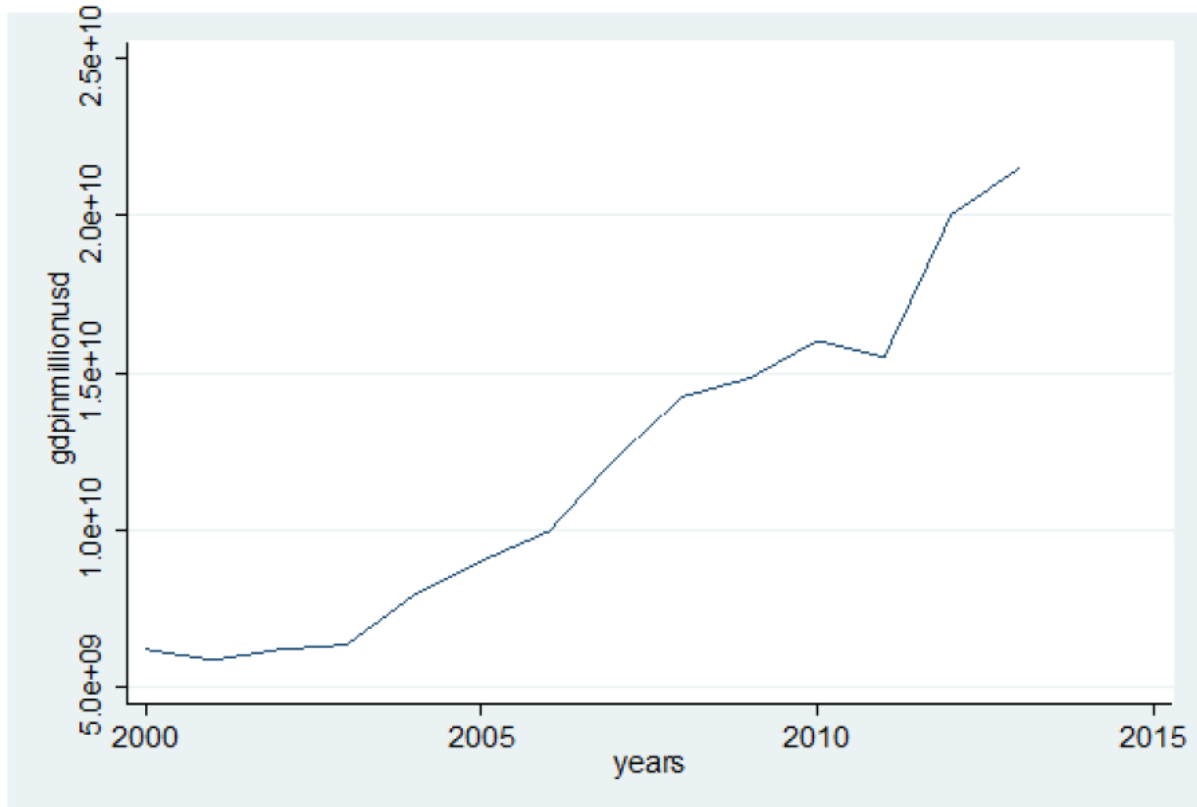
Figure 3 Line plot of GDP

Uganda has had a steady increase in GDP since 2000. This impressive growth in GDP over these years can be attributed to the restoration of the economic fundamentals, the return of the exiled community and the correction of state commercial adventures (UNCTAD, 2012).