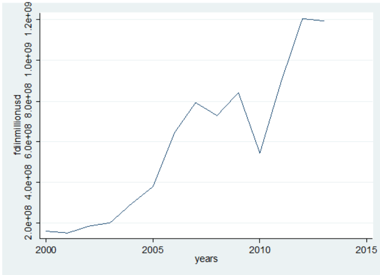
Figure 2: Line Plot of FDI

Figure 2 shows a steady increase in foreign direct inflows up to 2009, around 2004 and between 2011 and 2013. The decline in 2010 was due to the global financial crisis. This increase in capital inflows has been attributed to government divestiture and increased remittances by non-resident Ugandans (UNCTAD, 2012). The upward and down ward trend indicated shows that the series of FDI is not stationary.