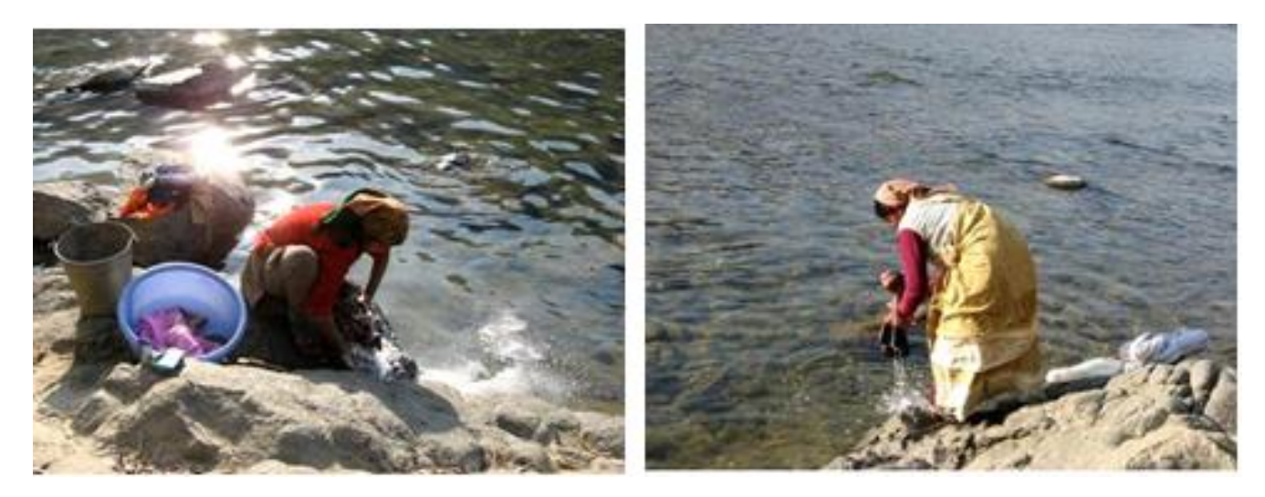
Plate 1: People force to wash their cloth in the direct flow of the Ramganga River (Ramganga gauge station near Naula village)

An interesting picture emerges when dividing the micro-watersheds into different zones according to elevation and aspect. This division is based on the assumption that water availability changes with increasing or decreasing altitude because of differences in both rainfall conditions and topographic settings. Aspect influences rainfall input as well as water loss through evapotranspiration. Although the uppermost areas in the watershed along the water divide receive fair amount of monsoon rains, they are the areas with least access to perennial water sources such as streams and major river (Ramganga). In many places, residents of these