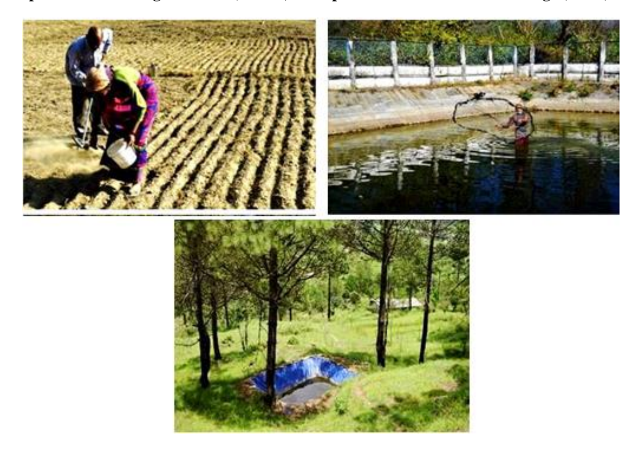
Plate 2-IWD based NRM practices, Field preparation for line-sowing (upper), Pisciculture promotion at-village-Chinoni (middle) lined percolated tank at Bhatoli village (down)

In terraced fields, there are two options which can adopt, in case of barren 'staggered trenches' can be made and in cultivated areas 'drainage trenches' can be made. In sloping fields which are not terraced, instead of trenches staggered pits and plantation along the bunds will work efficiently. Vegetative measures include brush-wood check dams, planting of low water demanding and shallow-rooted grasses, shrubs, trees, live hedge rows, inter-culture operations like mulching, gap filling etc. Social measures include control over grazing, limited fuel-wood and fodder cutting and social fencing of the recharge areas. Spring-shed development involves the preparation of spring-shed development plan, followed by the creation of the soil and moisture conservation and vegetative works. Significant changes that have occurred over the last couple of centuries in the land and vegetative features have had a deleterious impact on water resources. The management of water and other natural resources in the hill areas are logically thus dependent on location specific social and economic cultures. Anthropogenic changes therefore exert a direct impact on the water and other natural resources regime.